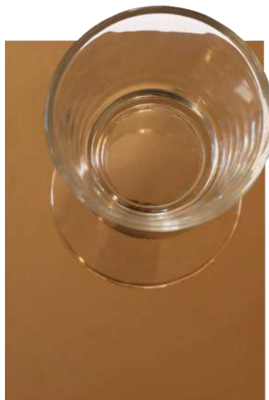
(A) SLEEK MIRRORED SURFACE