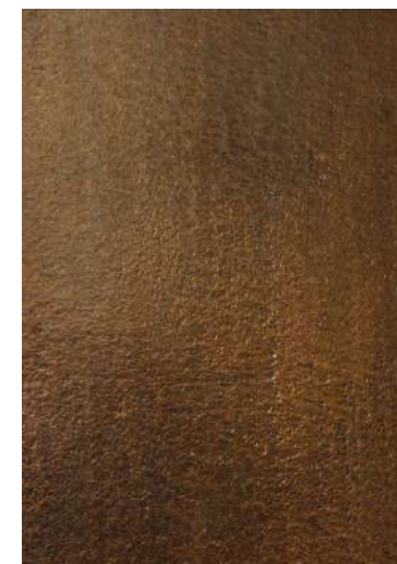
(F) TEXTURED SURFACE AND DARK BLACK PATINA