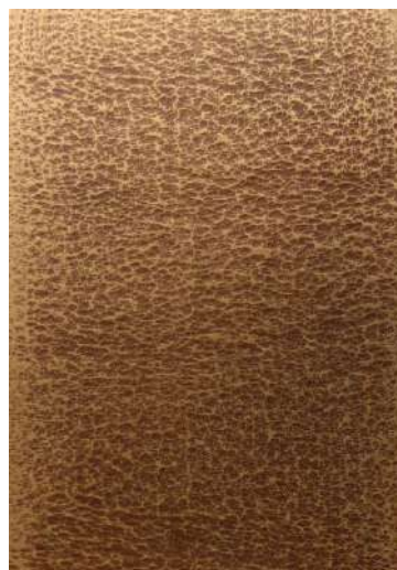
(E) TEXTURED SURFACE, BLACK PATINA AND POLISH TREATMENT