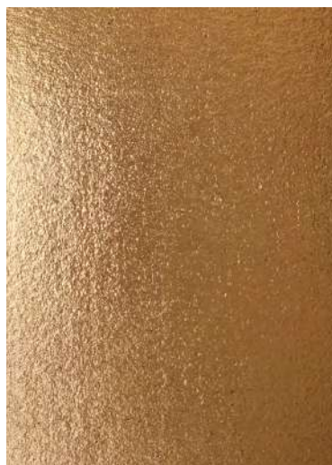
(D) TEXTURED POLISHED SURFACE