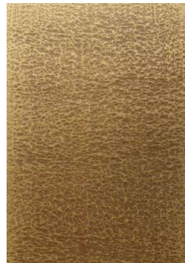
(E) TEXTURED SURFACE, BLACK PATINA AND POLISH TREATMENT