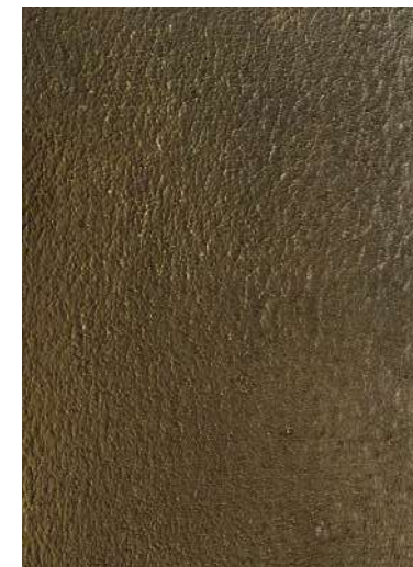
(F) TEXTURED SURFACE AND DARK BLACK PATINA