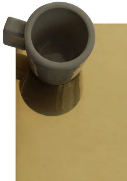
(A) SLEEK MIRRORED SURFACE