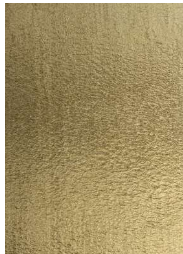
(D) TEXTURED POLISHED SURFACE