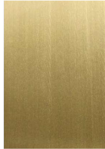
(B) BRUSHED MATT SURFACE