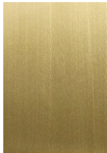
(B) BRUSHED MATT SURFACE