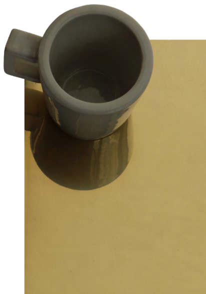
(A) SLEEK MIRRORED SURFACE