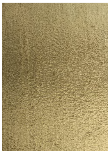
(D) TEXTURED POLISHED SURFACE