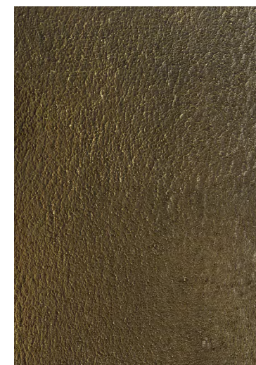
(F) TEXTURED SURFACE AND DARK BLACK PATINA