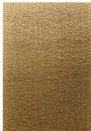
(E) TEXTURED SURFACE, BLACK PATINA AND POLISH TREATMENT