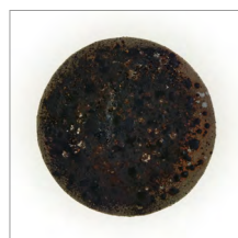
Lunaris Applique L Stoneware, lava stone & sand