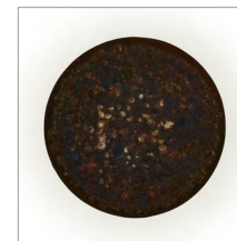
Lunaris Applique M Stoneware, lava stone & sand