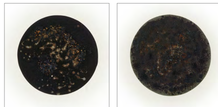
Lunaris Applique S Stoneware, lava stone & sand